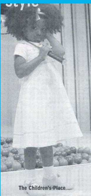
The Children's Place