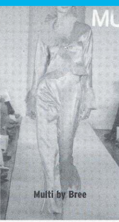
Multi by Bree